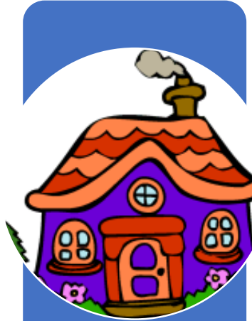
Stay in Tellico