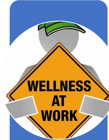
Rec and Wellness